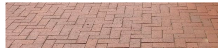
• Red Brick