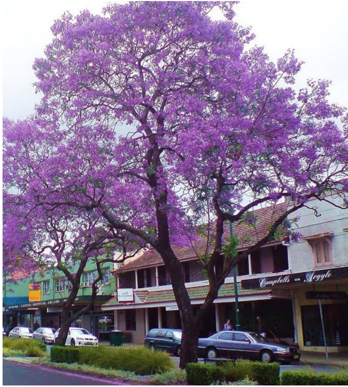
Jacaranda mimosifolia / Jacaranda Feature / Parklet tree