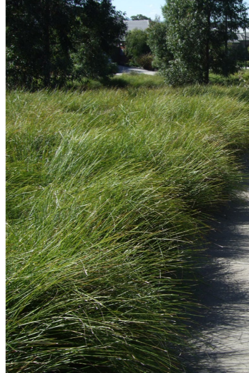
Proposed median planting - Lomandra 'Tanika' - a hardy plant with fine, bright green leaves.