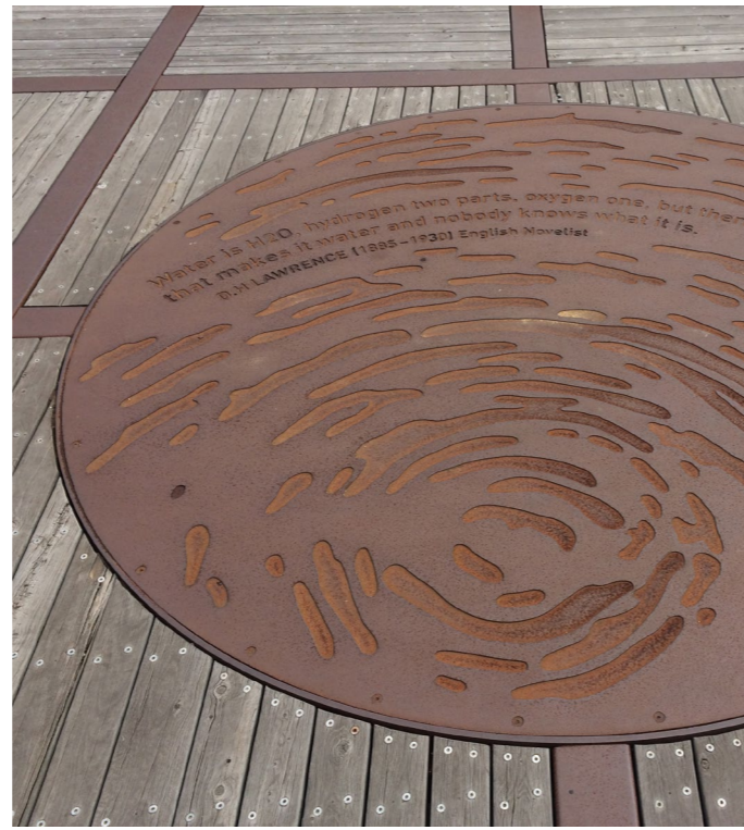
Proposed paving artwork eg. engraved steel plate