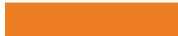
• Orange (Proposed signage and sculpture colour)