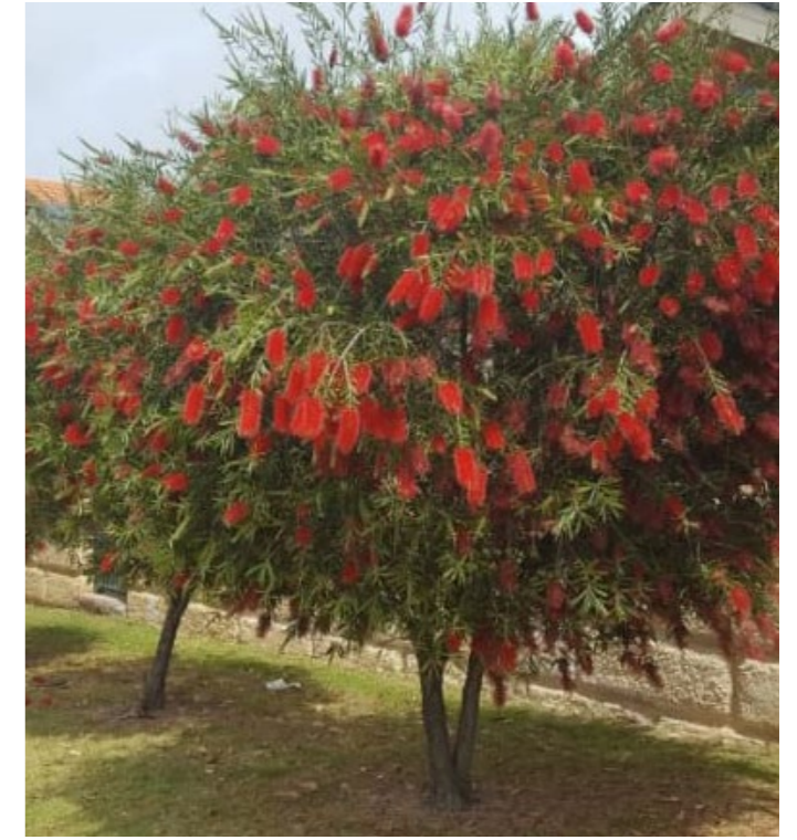
Callistemon 'King's Park Special' / Bottlebrush Small tree under powerlines in Block 3 (Baker Street to Camp Street)