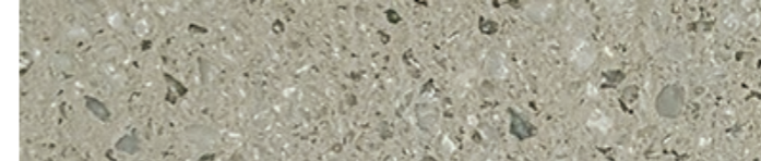
• Feature Paving