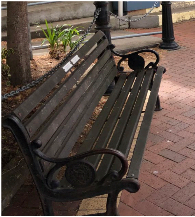
Existing bench seats to be relocated and refurbished including repainting and replacing timber slats