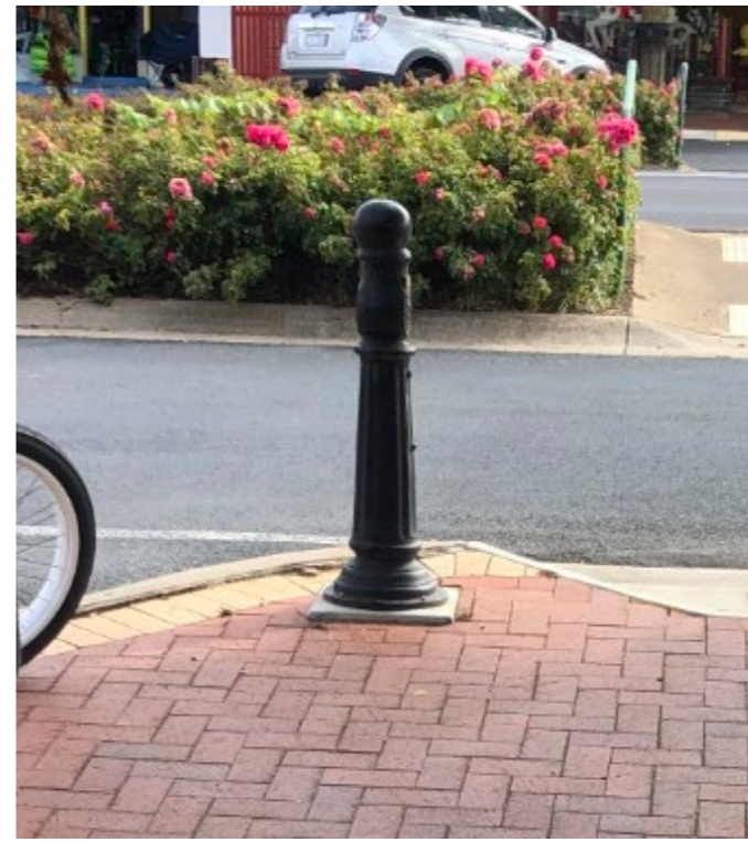
Existing cast iron bollards to be repainted and relocated. Some new bollards with chain link barrier between.