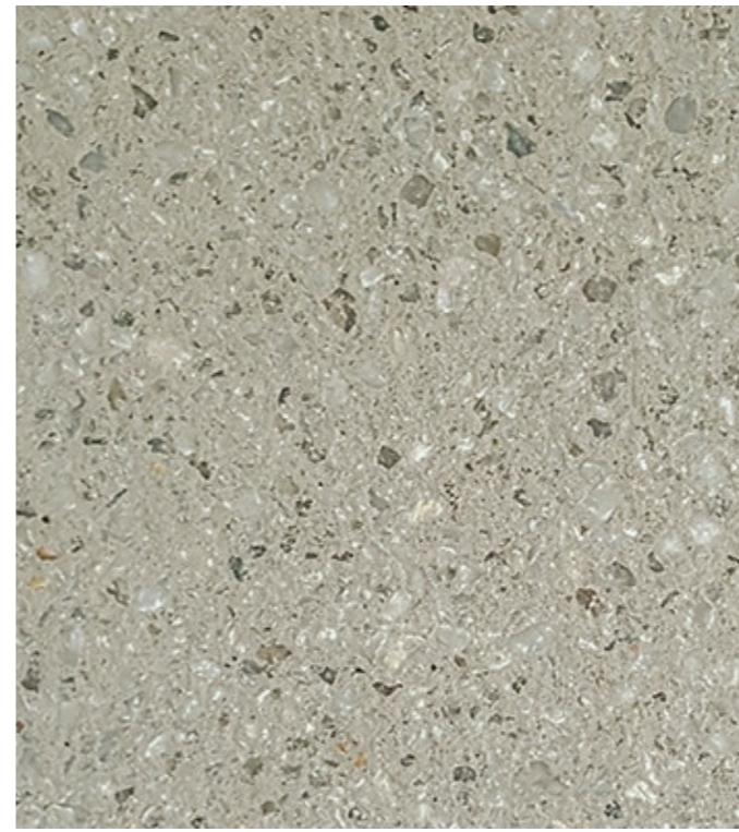
Feature pavement option - G2 Paver 'Hearth' by SVC or lightly honed exposed aggregate concrete.