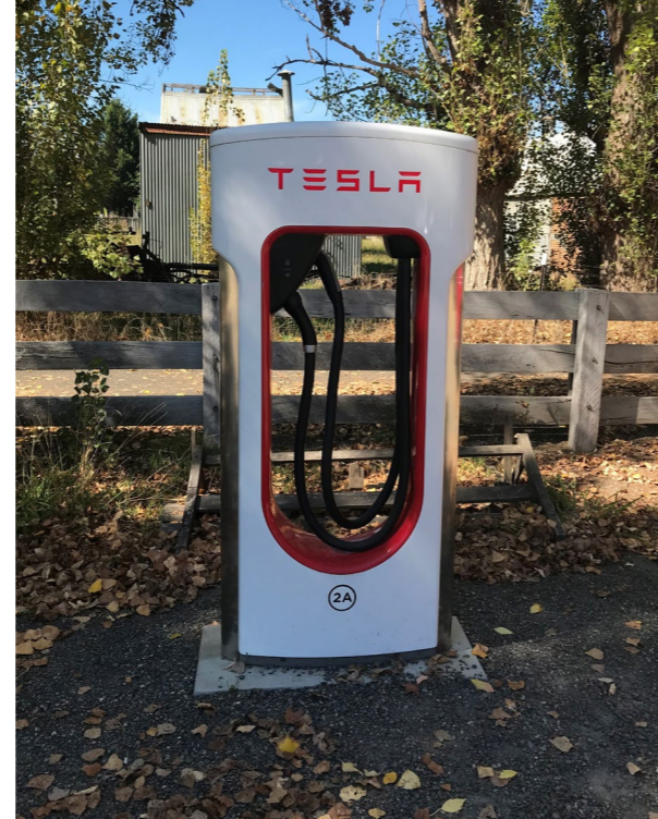
Electric vehicle charging station