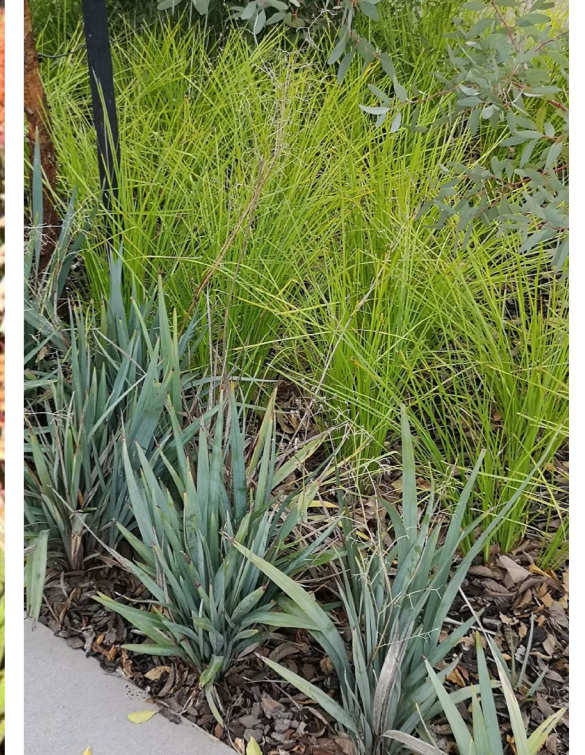
Mass planting grasses & ground covers at parklets.