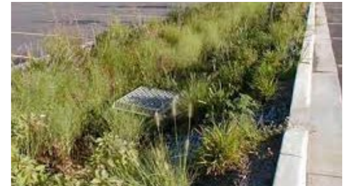
Tree pit in parking bay