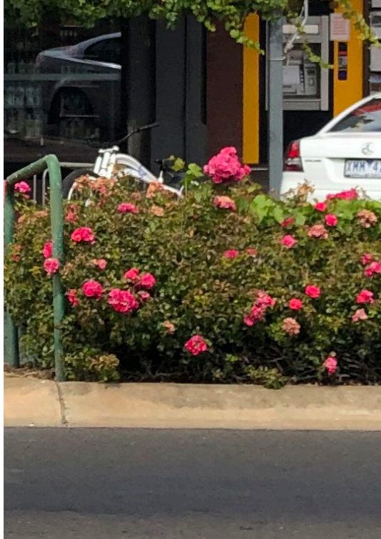
Roses - feature plant within median - retained at pedestrian crossings and intersections.