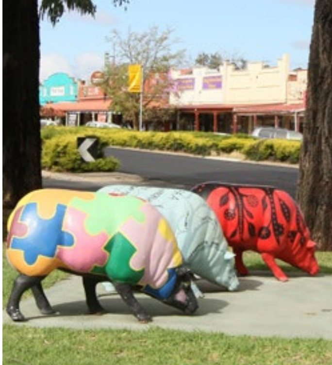
Flock of sheep sculptures to match existing streetscape art theme.