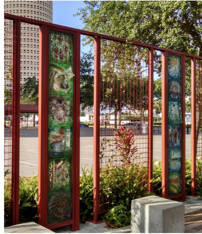
Green wall - mesh frame with vine