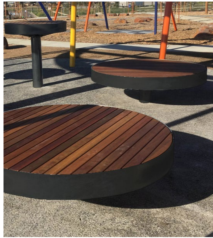
Proposed Pod seating and raised circular benches by Spark Furniture