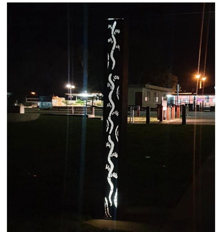
Lighting to proposed sculpture post