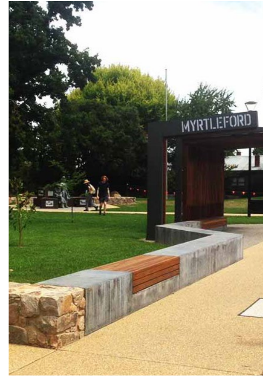
Parklet area with street furniture