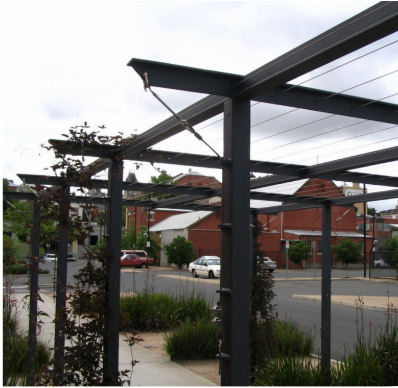
Steel-framed arbour with climbing vine