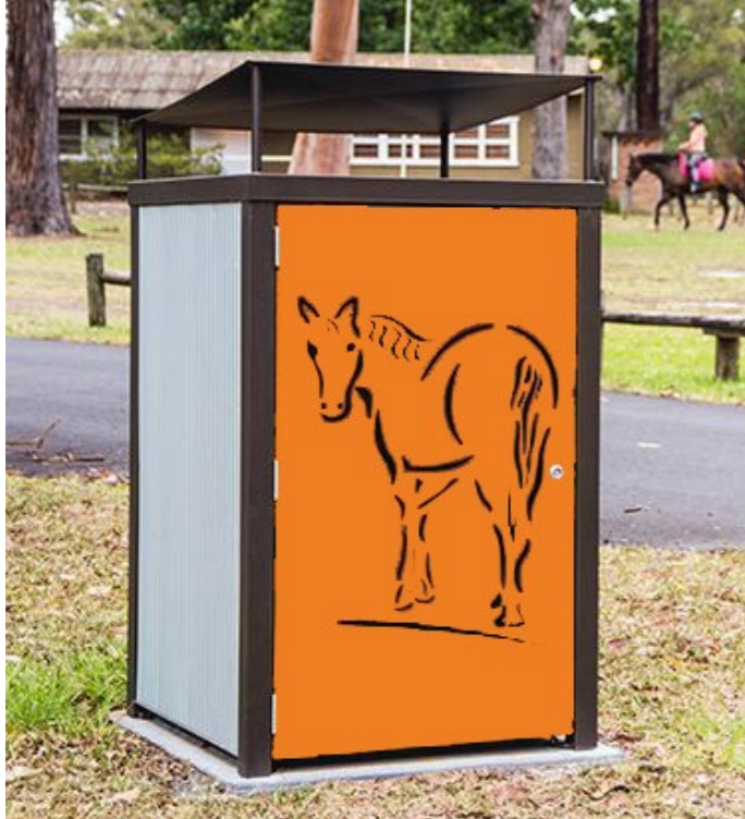
Example of proposed bin with custom laser cut panel