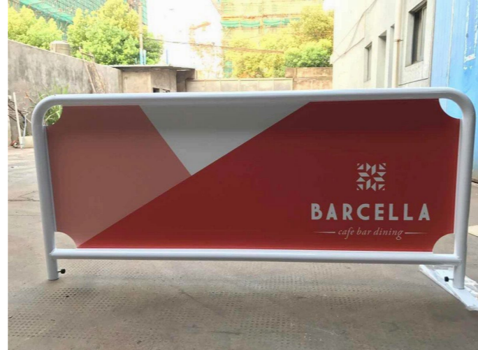
Exmple of removable cafe barrier with sleeve in ground and interchangeable canvas panel. Material types will vary for canvas / steel / glazing.