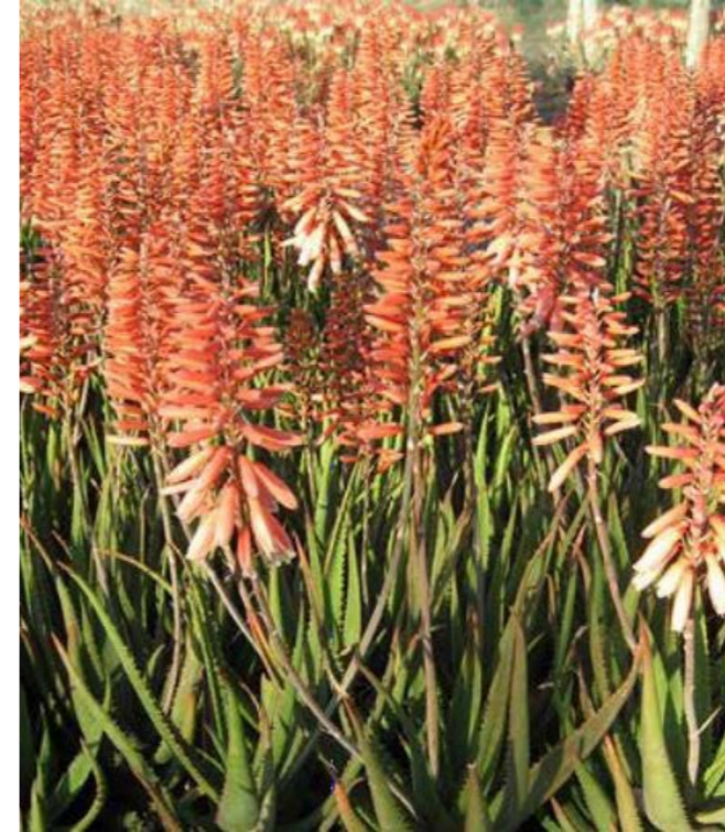
Proposed median planting - Aloe 'Mighty Coral' - a contemporary succulent with coral pink flowers in winter.