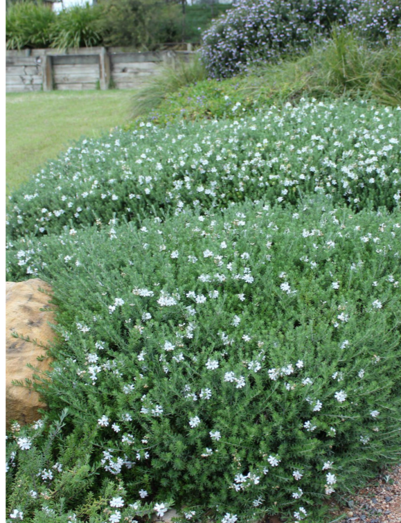
Proposed median planting: Westringia fruticosa 'Mundi' - a tough and long-flowering groundcover with white flowers.