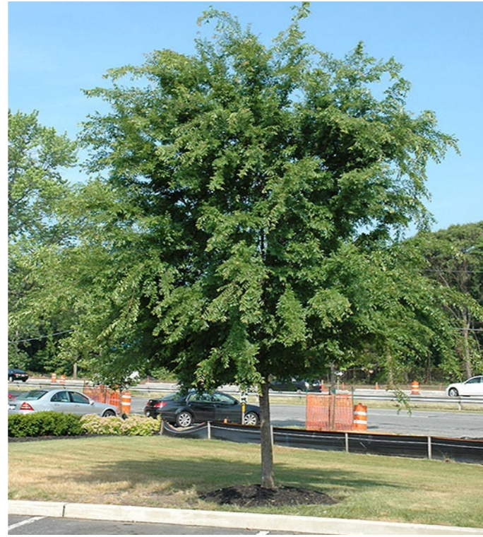
Ulmus parvifolia / Chinese Elm Large feature tree