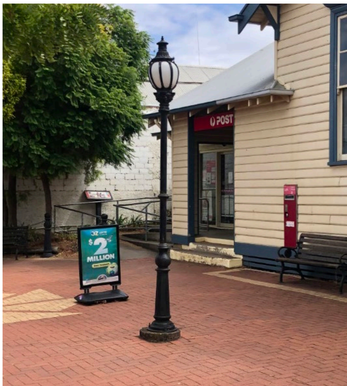
Existing heritage light poles