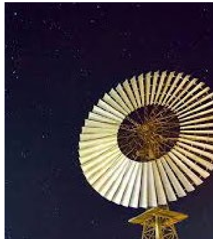
Uplighting to windmill