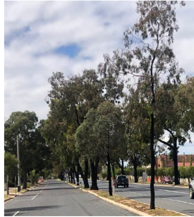
Eucalyptus sideroxylon / Red Ironbark Infill planting in the centre median of block 3 (Baker Street to Camp Street)