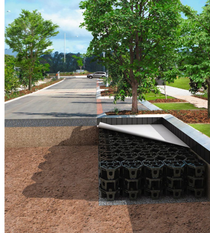
Tree cell diagram