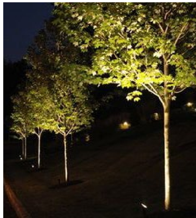
Uplighting to centre median trees in Block 3