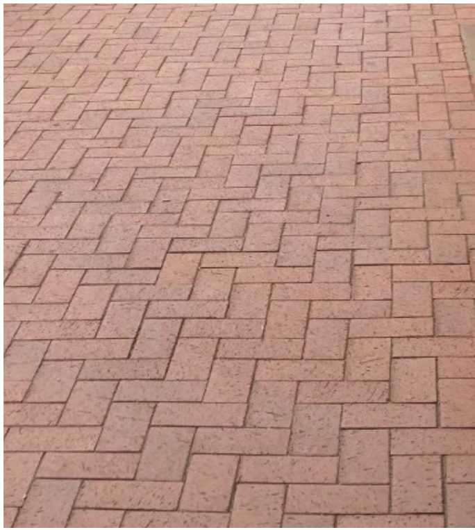
Existing red brick paving - remove yellow brick edges to modernise