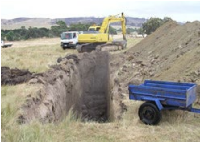
Example of on-farm trench burial

Previous drought experience has shown that approximately 10 adult sheep in poor condition and with limited wool will take up one cubic metre of pit space. (North-East Region Flock Reduction Scheme)