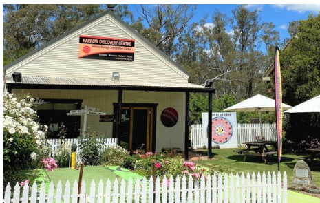
The Harrow Discovery Centre