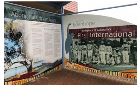
The Aboriginal Cricket Trail