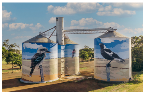
Silo Art Trail