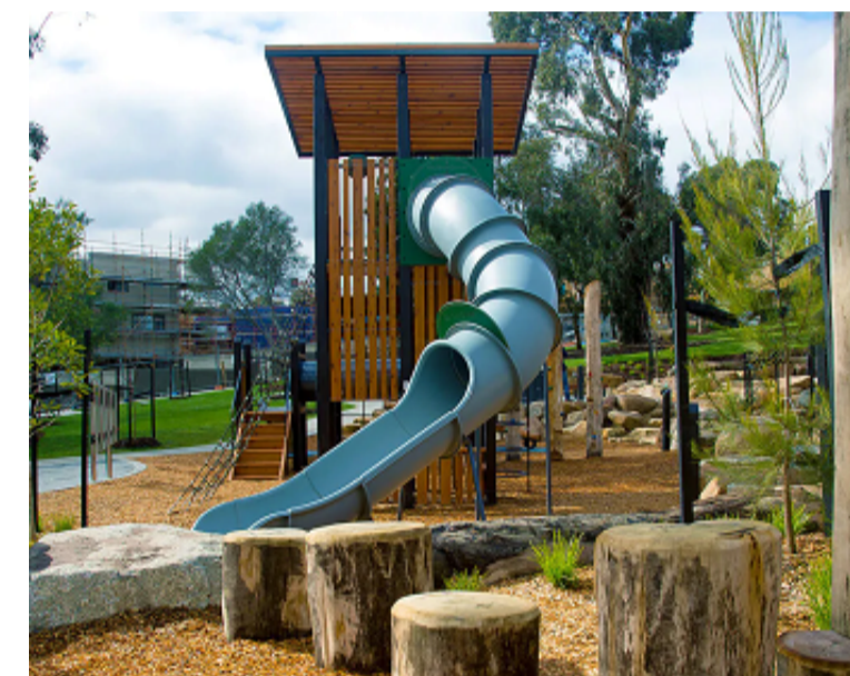
Natural colour and material palette (Adventure +)