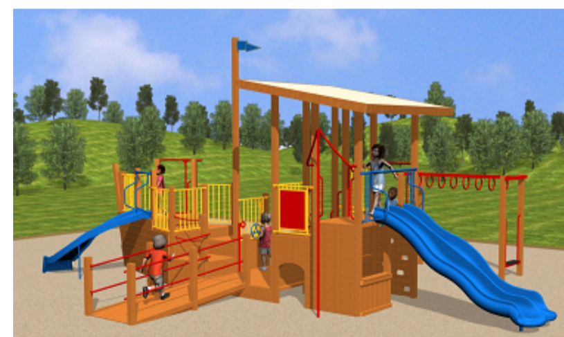
Boat theme (Adventure +)