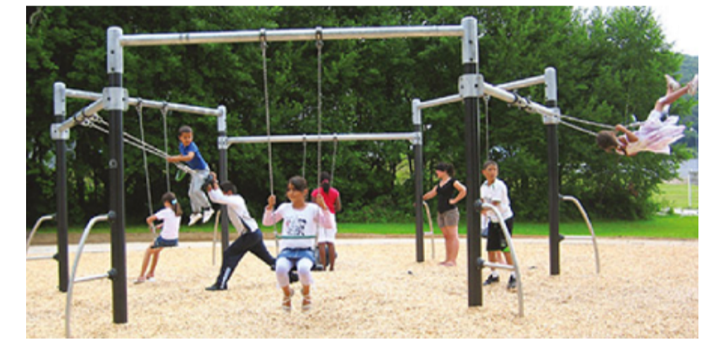
Swing x 5