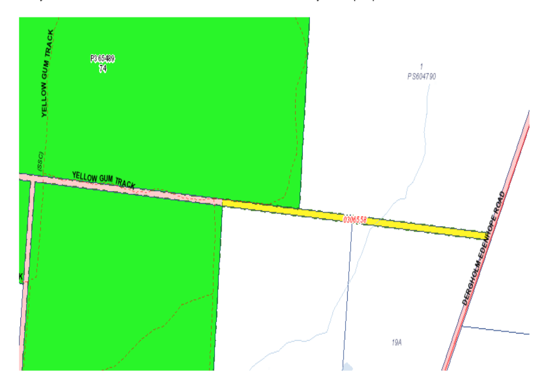
Our description on licence is ROAD NORTH OF ALLOTMENTS 19 19A NO SECTION PARISH OF DERGHOLM. Licence number is 0306558 – but there are multiple unused roads on this one licence