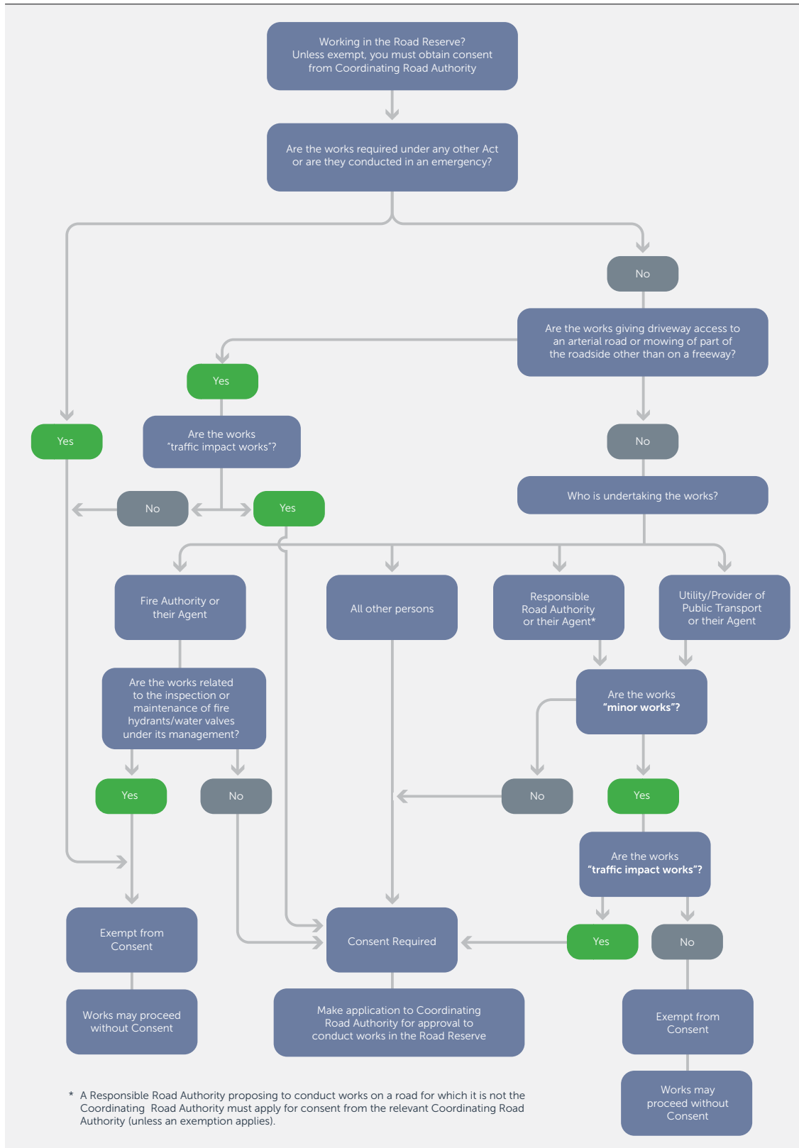
Flow Chart 1 Consent Application Requirements