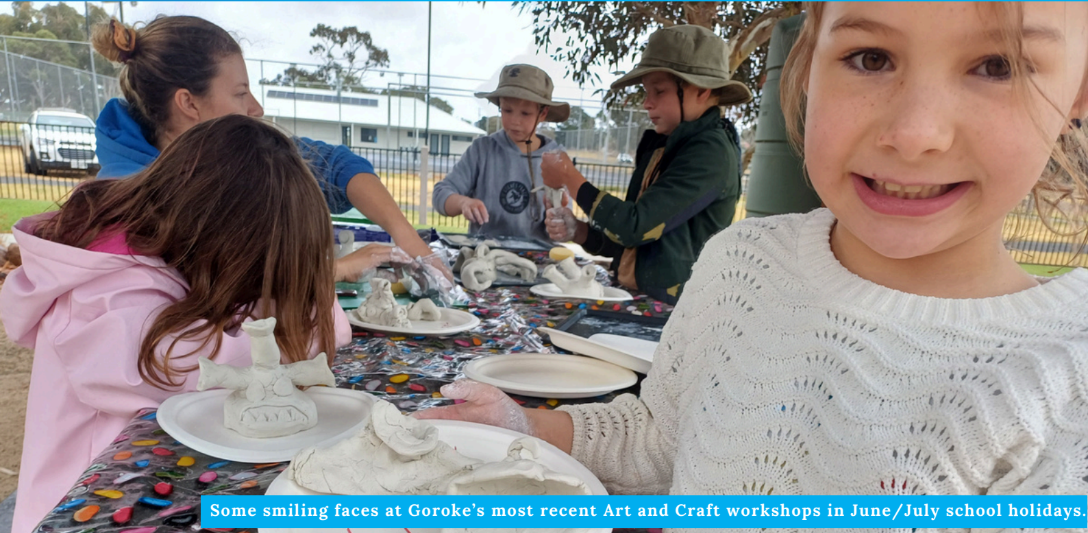
Some smiling faces at Goroke's most recent Art and Craft workshops in June/July school holidays.