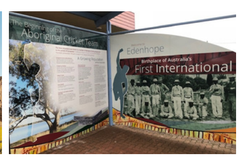
The Aboriginal Cricket Trail