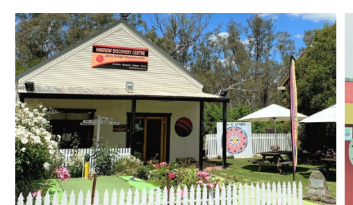
The Harrow Discovery Centre